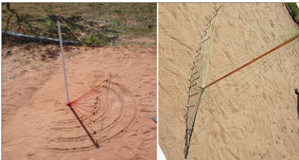
Fig. 2. Two observational settings for studying the shadows cast by 1-meter vertical gnomons during the 2011 December solstice. Left image is from Natal (Lat: 5.8^{\circ}\text{S} ), while the image to the right is from Caxias do Sul (Lat: 29.2^{\circ}\text{S} ). Theoretical values for the angles between the gnomon and the solar noon threads (the shortest ones) are 17.7^{\circ} = |5.8^{\circ} - 23.5^{\circ}| for Natal, and 5.7^{\circ} = (29.2^{\circ} - 23.5^{\circ}) for Caxias do Sul. Measured values were actually 17^{\circ} and 7^{\circ} , respectively. Note that while the concavity of both curves made by the sticks on the ground is approximately the same (the picture on the right was rotated in order to better show this), these declination lines fall on opposite sides of the gnomon: the one in Natal falls to the north of the base of the gnomon and the one in Caxias do Sul to the south. In both images the north is to the right, as can be inferred by the last shadow cast by the gnomons—and visible in the pictures—which, coming from the southwestern setting Sun, points approximately toward the northeast.